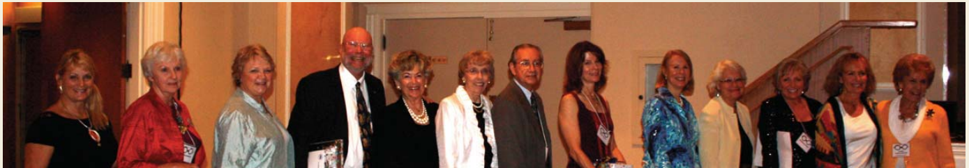
Pictured above are the award winners who attended the convention. A complete list of winners is in the catalog.